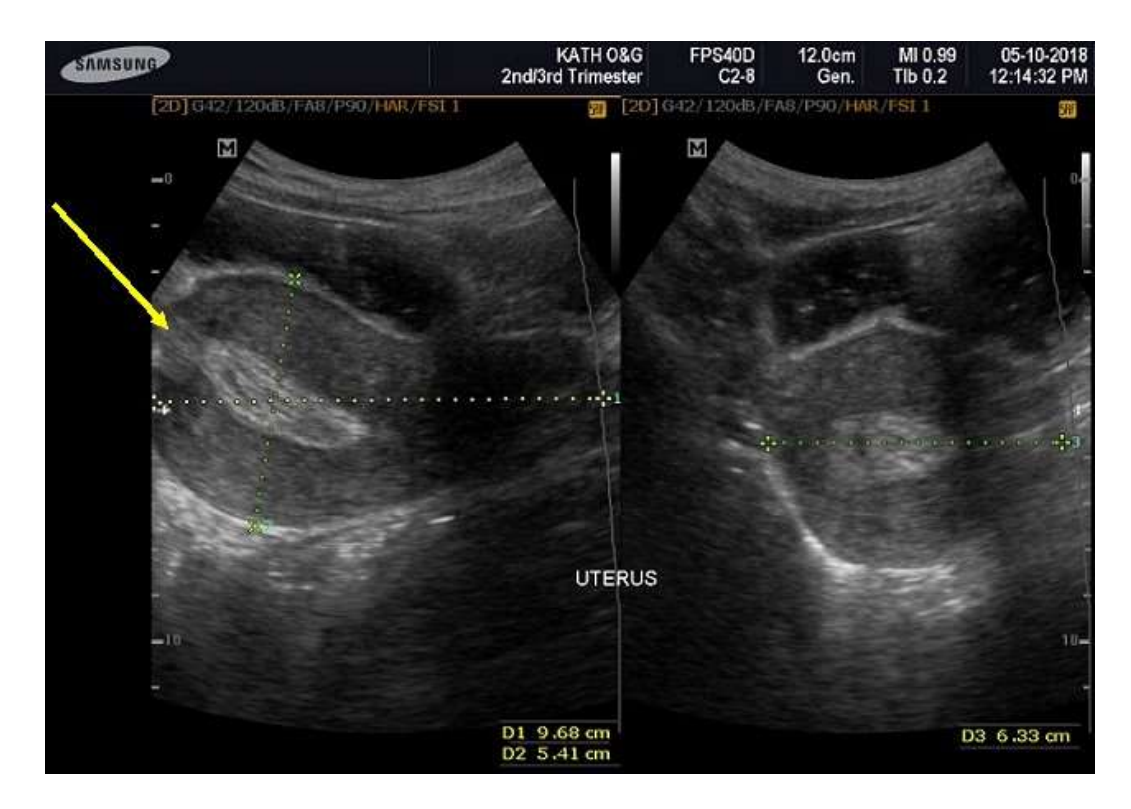
Figure 3: Midsagittal view of defect at the aspect of the wall, representing perforation.