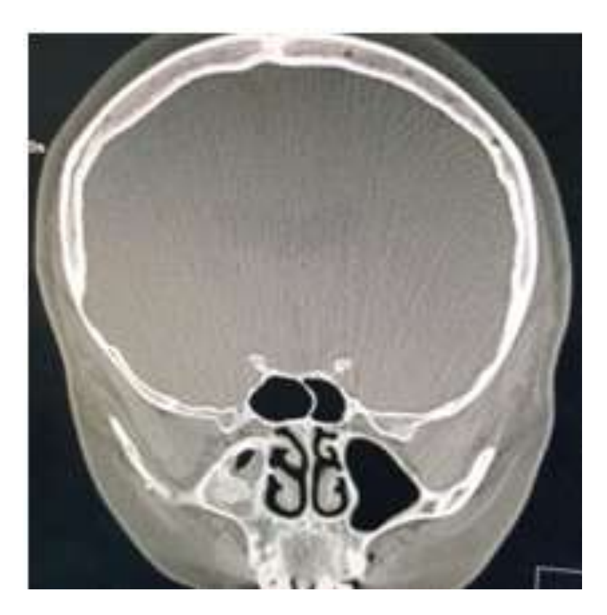
Figure 1. Computed tomographic scan. Coronal view showing a heterogeneous opacity with metal dense foreign body of the right maxillary sinus cavity.

literature, maxillary sinus was the most affected sinus in our study (47 %) (9/19).