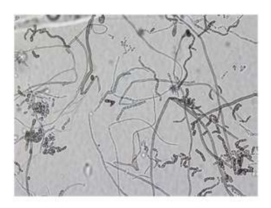
Figure 4. Microscopic findings of the specimen of fungus ball located in concha bullosa, showed dark brown arthroconidia-like cells with small hyaline conidia or clustered conidia (Aureobasidium species)

The characteristic surgery is called functional endoscopic sinus surgery (FESS) and the recurrence rate is very low. <sup>2,18</sup> FESS also provides high success and low morbidity. Mainly it is necessary to obtain a wide opening of the affected sinus or sinuses and complete removal of all the fungal conglomerate by the help of cured suctions and forceps. An uncinectomy and a wide middle meatus antrostomy is required for FB maxillary of the sinus. Endonasal sphenoidotomy and partial or complete