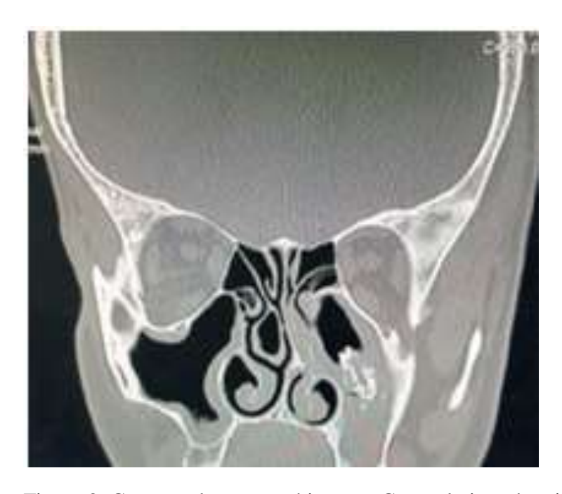
Figure 2. Computed tomographic scan. Coronal view showing a heterogeneous opacity with metal dense foreign body of the left maxillary sinus cavity.

Fungus balls have never been reported in children before puberty. Hormonal factors may be responsible for the female predominance. 1,10,17 Dufour et al. declared an indirect hormonal influence on the FB formation, that could explain absence of FB in children before puberty. In the present series, there were no patients under the age of 19. Endodental treatments are rare in young population and FB frequency may be lower for this factor 10,18 FB frequently the